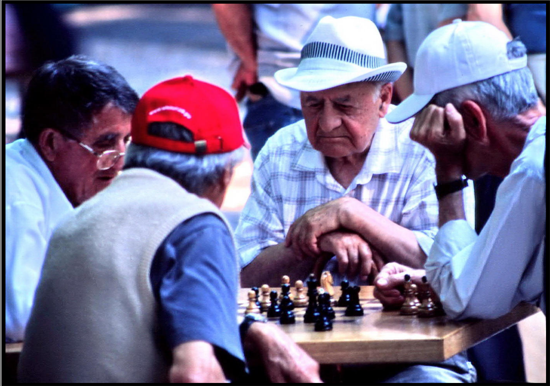
© Do not only trust your mind before the next move of you life, but also your gut feeling. © Lusty pensioners of Belgrade often spend the day with chess playing in the parkway of the Tvrdjava fortress – June 2007