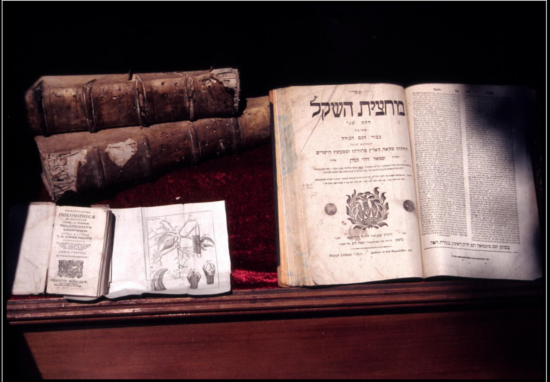
☺ The book of your life has been written long ago. You decide how it has to be read. ☺ Very old books, hard to read, are displayed in a shop's cabinet in the pedestrian zone of Belgrade - June 2007